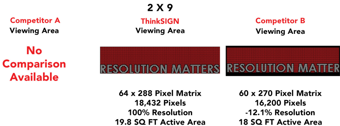
10mm Resolution Module

ThinkSIGN's 10mm borderless Xtreme, when compared to other brands, maximizes your allowable square footage resulting in MORE pixels and resolution.