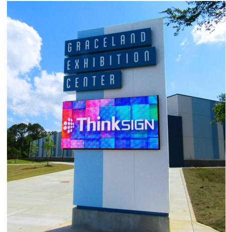
6mm 144x288 4.5' x 9'